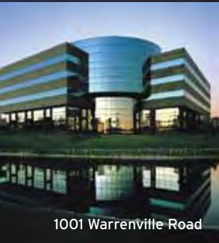
1001 Warrenville Road