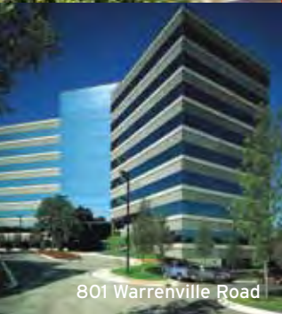
801 Warrenville Road