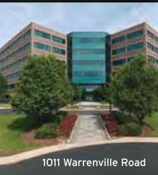
1011 Warrenville Road