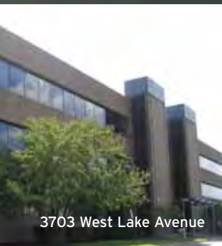
3703 West Lake Avenue