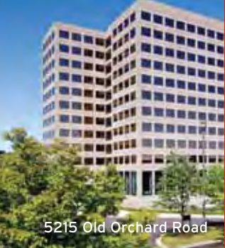
5215 Old Orchard Road